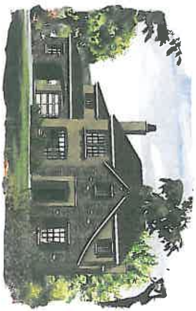
residence 3d ~ European Country (as modeled)