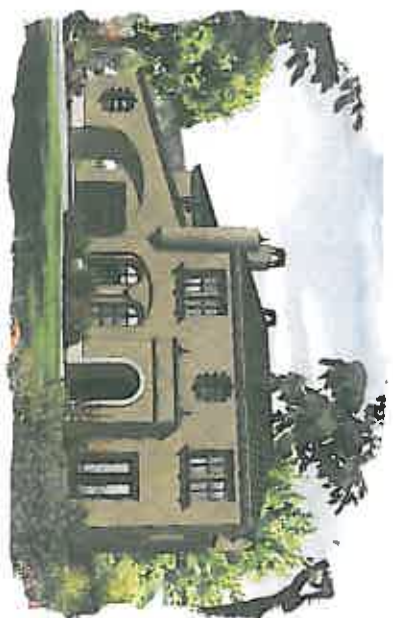
residence 3a ~ Spanish Colonial