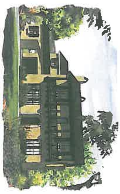
residence 36 ~ Monterey Ranch