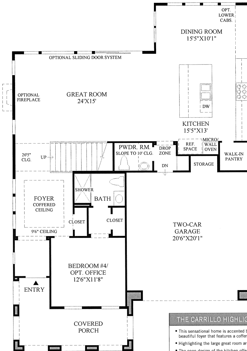
First Floor TUSCAN EXTERIOR DESIGN SHOWN