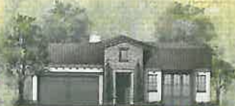
RESIDENCE 1B TUSCAN 2,840 sf