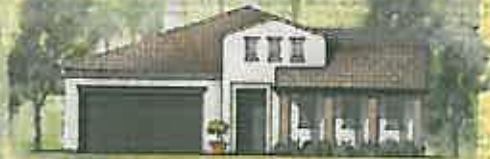
RESIDENCE 1C MONTEREY RANCH 2,830 sf