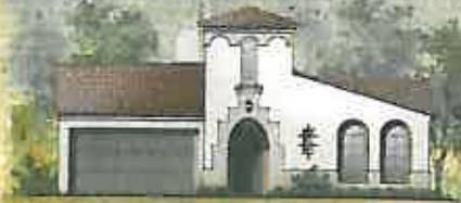
RESIDENCE 1A SANTA BARBARA 2,823 sf