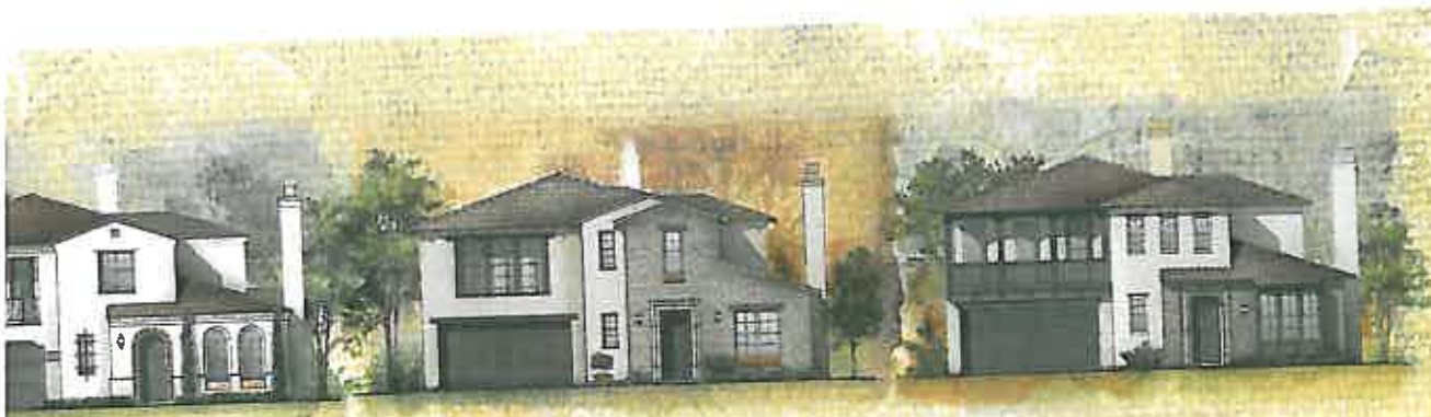
RESIDENCE 2A VIA BARBARA 3,688 sf MODEL